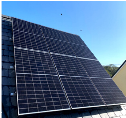
SOLAR PV SYSTEM