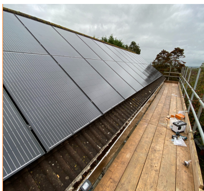
SOLAR PV SYSTEM