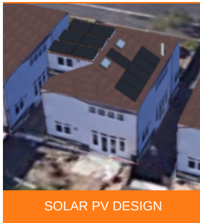
SOLAR PV DESIGN