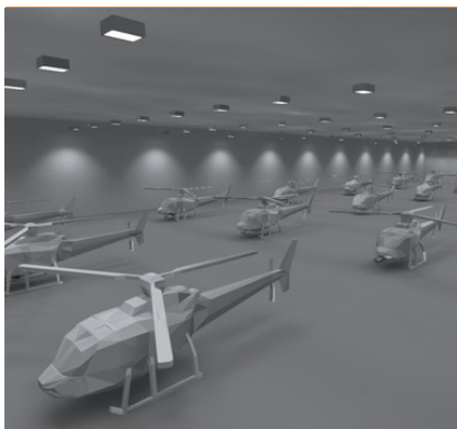
3D LED LIGHTING DESIGN