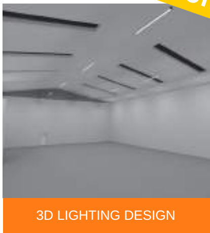
3D LIGHTING DESIGN