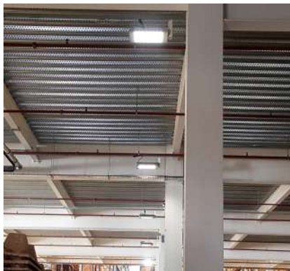
GENTLESPACE GEN 2