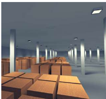
3D LED LIGHTING DESIGN

Using our in-house design team, we produced a full 3D simulation model to calculate a more ambient lighting level throughout the warehouse. The LED installation consist of 60 GentleSpace Green Warehouse LED luminaire, which will produce an estimated 13,200 KWh a year, reducing the electrical energy by over 60%. It are controlled through detection technology and control system.