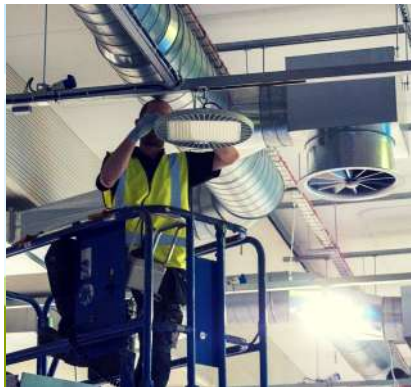
HIGH BAY CORELINE